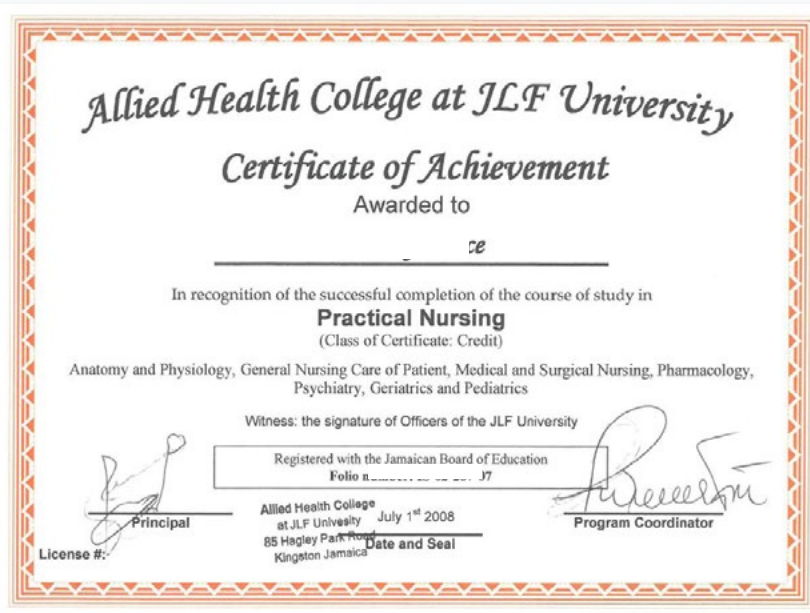
Figure 4: Practical Nursing Certificate from JLF University Allied Health College, which was prosecuted in the state of Florida in 2011

Figure 4 above shows a practical nursing certificate from Allied Health College at JLF University. JLF University, which has affiliated locations in Florida, Haiti and Jamaica, was sued by Florida Attorney General Pam Bondi for defrauding students in 2011. The following year, the university and its affiliates were required to pay $469,000 in restitution and an additional $67,000 in civil penalties 7 . The institution's website and the transcript for the above qualification together claim accreditation by Accrediting Commission International (ACI), the Association of Distance Learning Programs (ADLP), and the United States Distance Learning Association (USDLA). However, all three entities are accreditation mills.