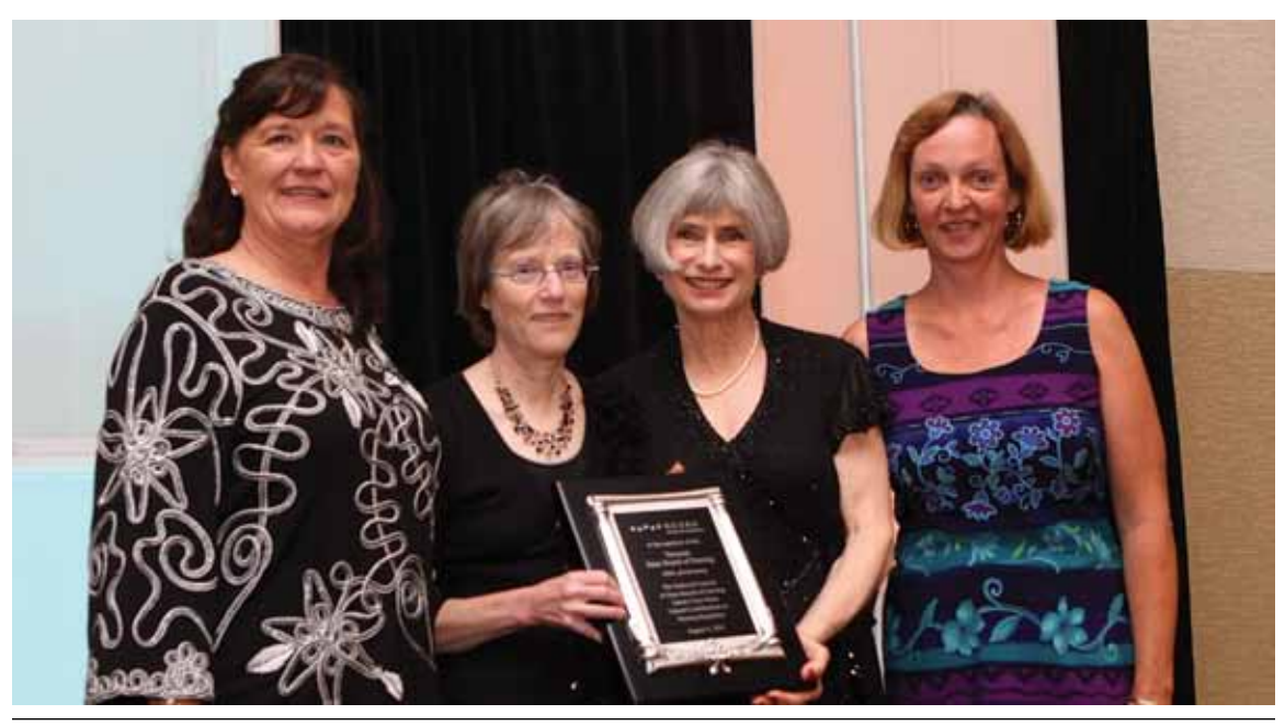
Vermont State Board of Nursing

Without continual growth and progress, such words as improvement, achievement, and success have no meaning.