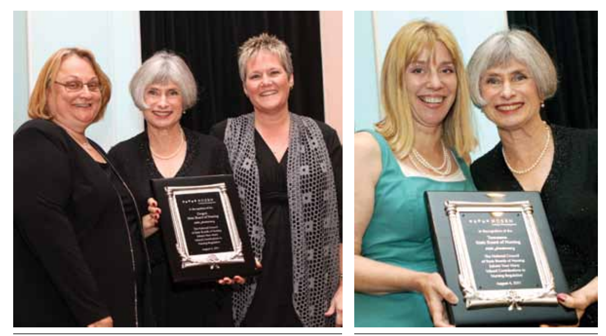
Oregon State Board of Nursing