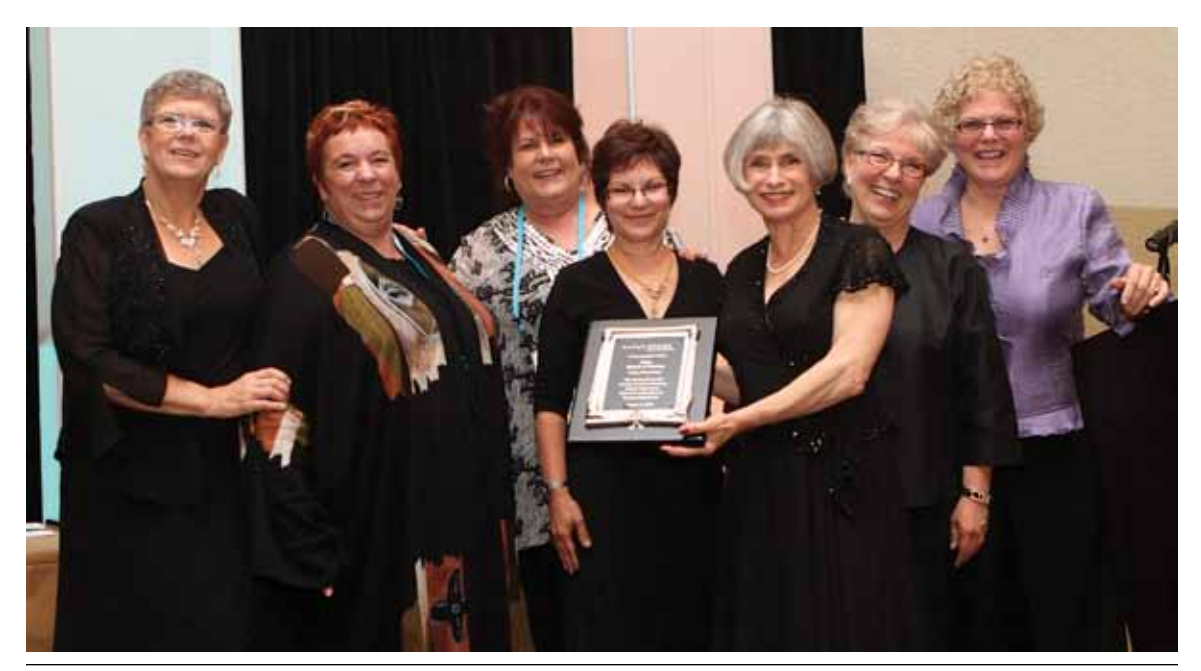
Idaho Board of Nursing