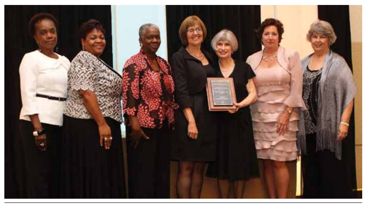
Virginia Board of Nursing

The Regulatory Achievement Award recognizes the member board that has made an identifiable, significant contribution to the purposes of NCSBN in promoting public policy related to the safe and effective practice of nursing in the interest of public welfare. (photo below)