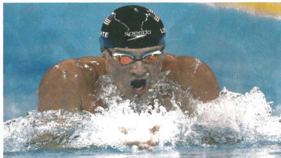
Ryan Lochte, seen competing in Rio on Aug. 11, has lost four sponsors following an incident at a gas station during the Games.

"While we have enjoyed a winning relationship with Ryan for over a decade and he has been an important member of the Speedo team, we cannot