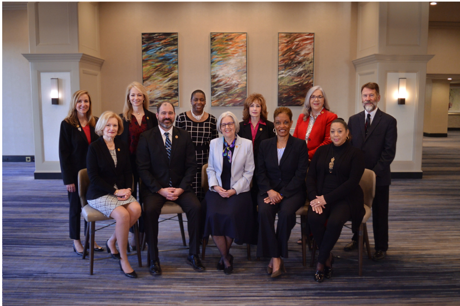
2022 NCSBN ANNUAL MEETING | Aug. 17 – 19, 2022