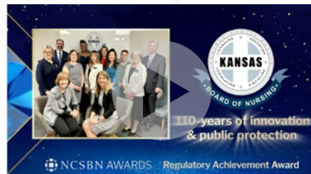
Kansas State Board of Nursing

The Regulatory Achievement Award recognizes the member board or associate member that has made an identifiable, significant contribution to the mission and vision of NCSBN in promoting public policy related to the safe and effective practice of nursing in the interest of public welfare.